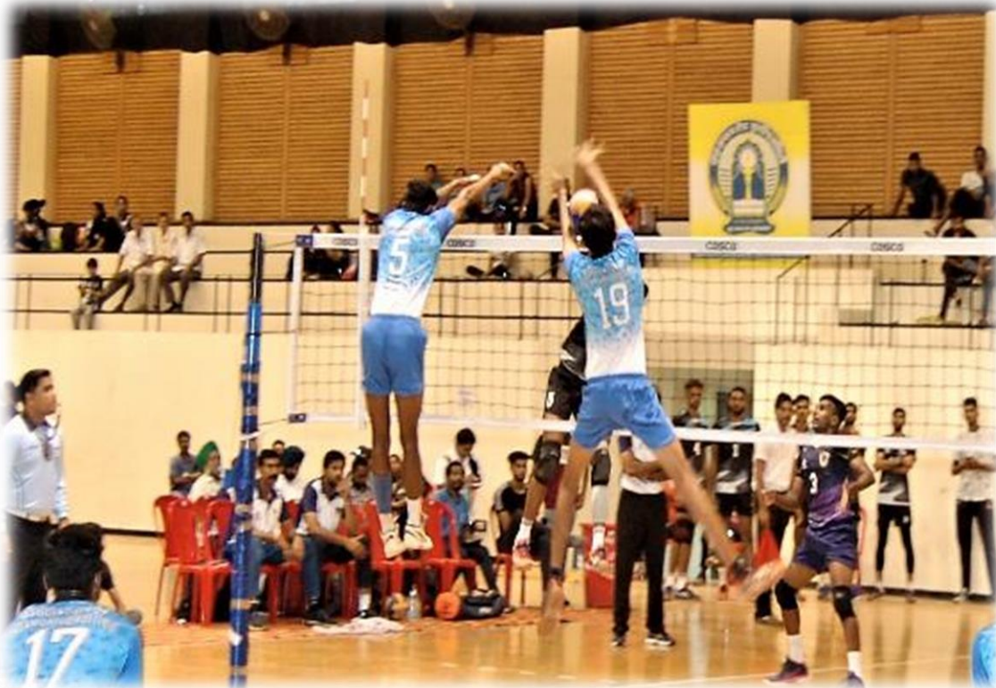
A moment of match between Railways & Indian Universities Men Teams