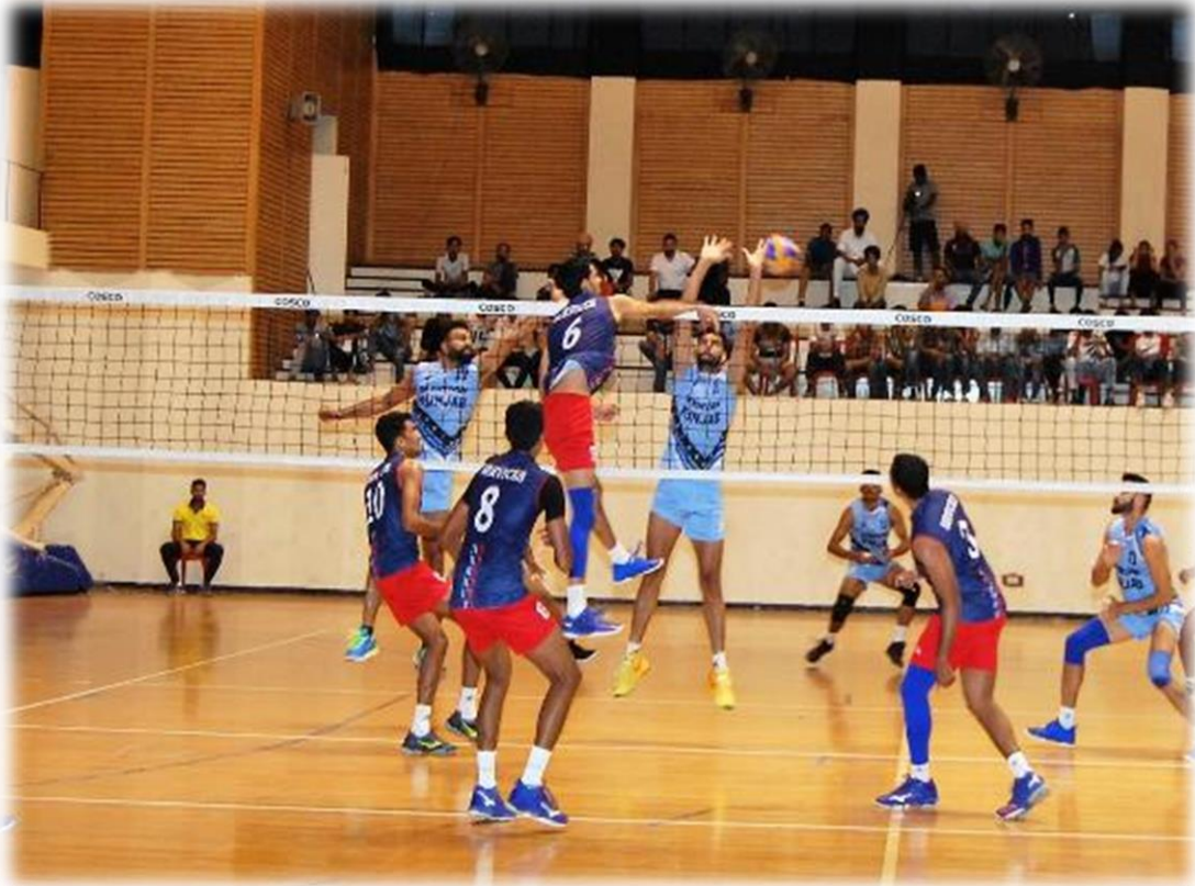
A moment of match between Services & Punjab Men Teams