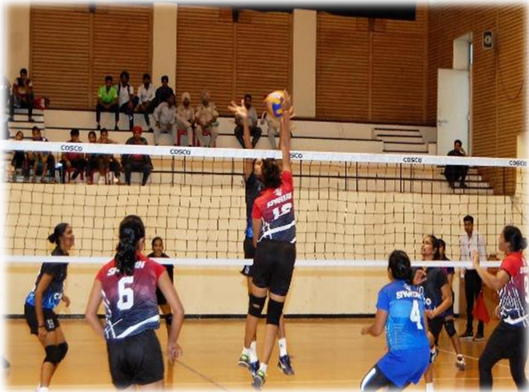
A moment of match between Maharashtra & Kerala Women Teams